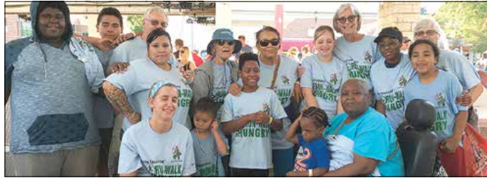
▲ The Capuchins' Run-Walk for the Hungry, held this year on June 15, will support the St. Ben's Community Meal and House of Peace.

A new 2-mile walkers' course will route participants through Lakeshore State Park and onto the scenic island,