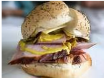
PHOTO GALLERY Metro Detroit's best sandwiches Hungry? You will be after you see a special gallery of the best sandwiches the area has to offer.