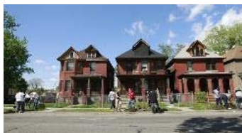
Enlarge

E-mail | Save | Print | Reprints & Permissions | RSS