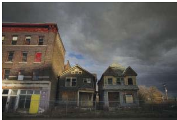
Shuttered homes line a downtown Detroit street. An estimated one in three Detroiters lives in poverty, making it the poorest large city in the United States.

Detroit is a city of Hope rather than a city of Despair. The thousands of vacant lots and abandoned houses not only provide the space to begin anew but also the incentive to create innovative ways of making our living—ways that nurture our productive, cooperative and caring selves.