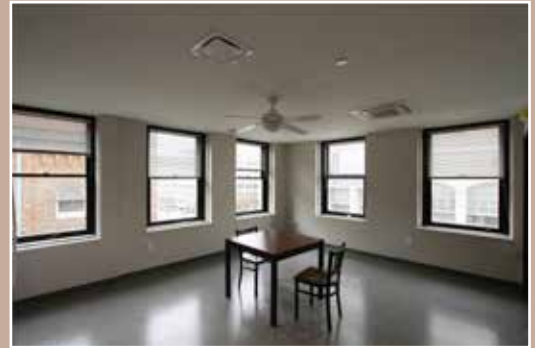
A view of a corner apartment unit at St. Anthony Place.