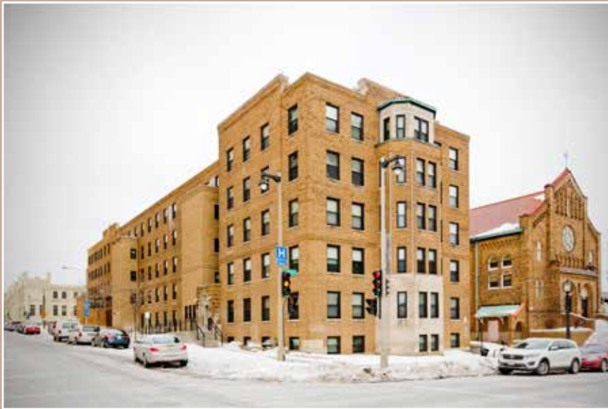
St. Anthony Place, adjacent to St. Benedict the Moor parish, at 10th and State Street in downtown Milwaukee.

Building includes space for Capuchin Community Services